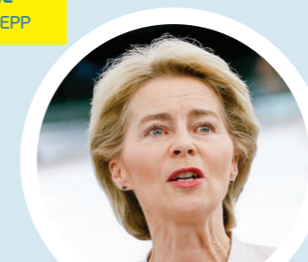
URSULA VON DER LEYEN President of the European Commission