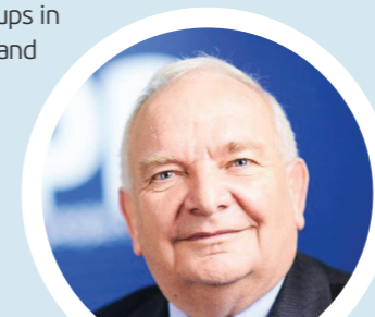
JOSEPH DAUL President of the EPP

Following the results of the 2019 EU elections, the EPP-CoR Group is committed to working closely with the members of the EPP Group in the European Parliament led by Manfred Weber and Ursula von der Leyen President of the European Commission.