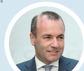
MANFRED WEBER Chairman of the EPP Group in the European Parliament